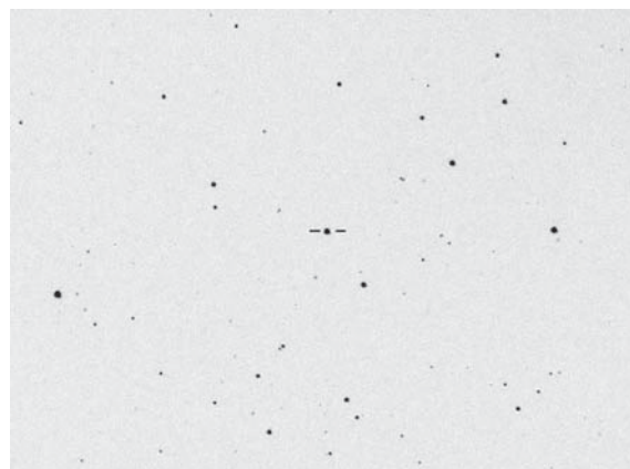
Figure 1. Field of V1663 Aquilae (N up, E to left, width 15'). David Boyd

Official announcement of the discovery on IAU Circular 8544 assigned the designation V1663 Aquilae.